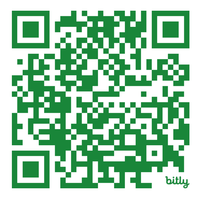
Link to Early Learning Coalitions Directory