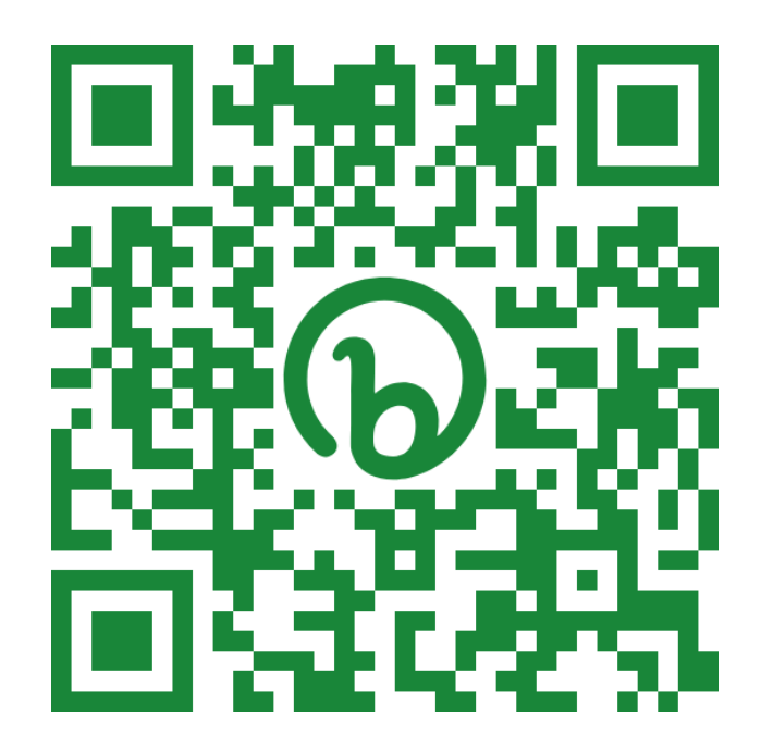
Link to DEL Website